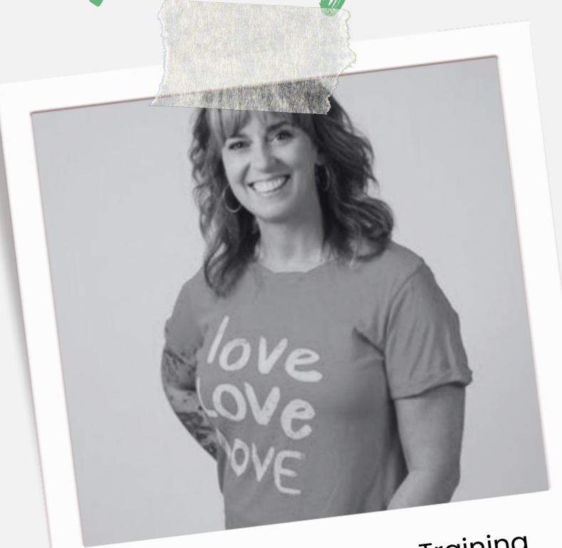
Director of Corporate Training

Specialty: Also teaches: Certifications: